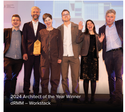
2024 Architect of the Year Winner dRMM – Workstack