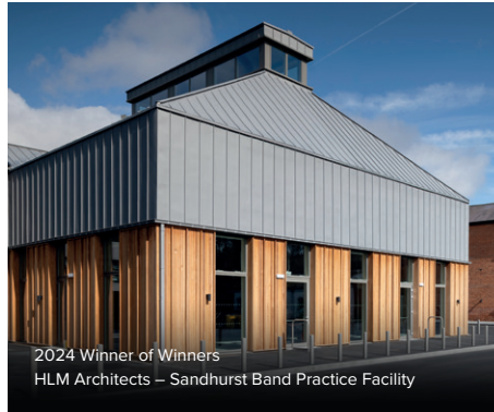
2024 Winner of Winners HLM Architects – Sandhurst Band Practice Facility