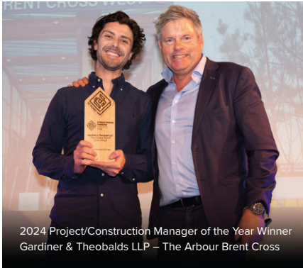
2024 Project/Construction Manager of the Year Winner Gardiner & Theobalds LLP – The Arbour Brent Cross