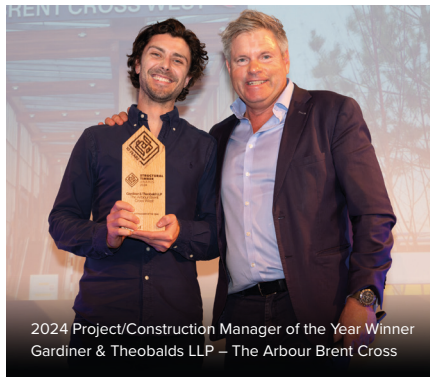
2024 Project/Construction Manager of the Year Winner Gardiner & Theobalds LLP – The Arbour Brent Cross