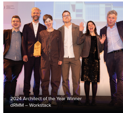
2024 Architect of the Year Winner dRMM – Workstack