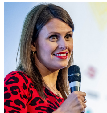
2023 Host - Ellie Taylor