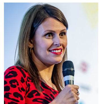
2023 Host - Ellie Taylor